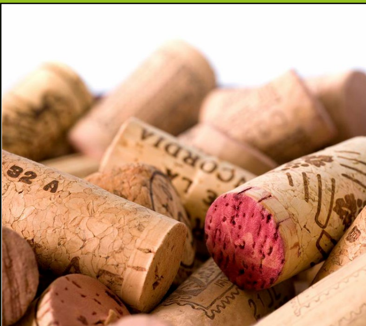
Wine Bottle Cork