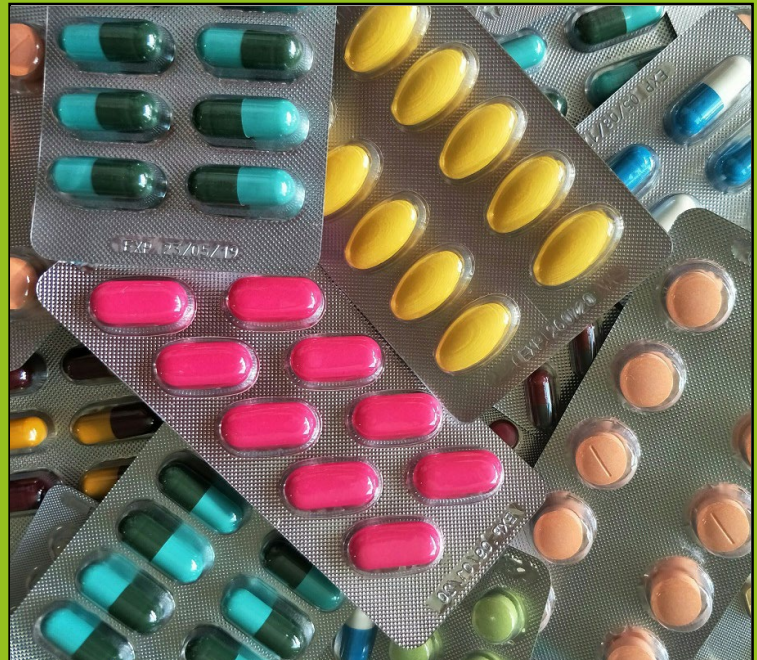
Tablet Blister Packs