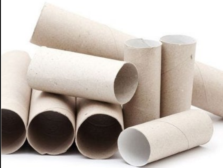
Toilet Roll Inserts