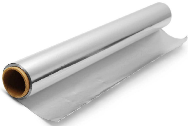
Aluminium Wrapping Foil and Trays