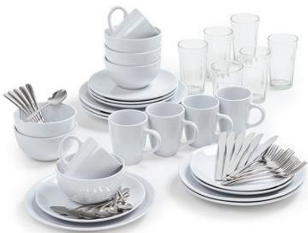
Crockery and Mirrors