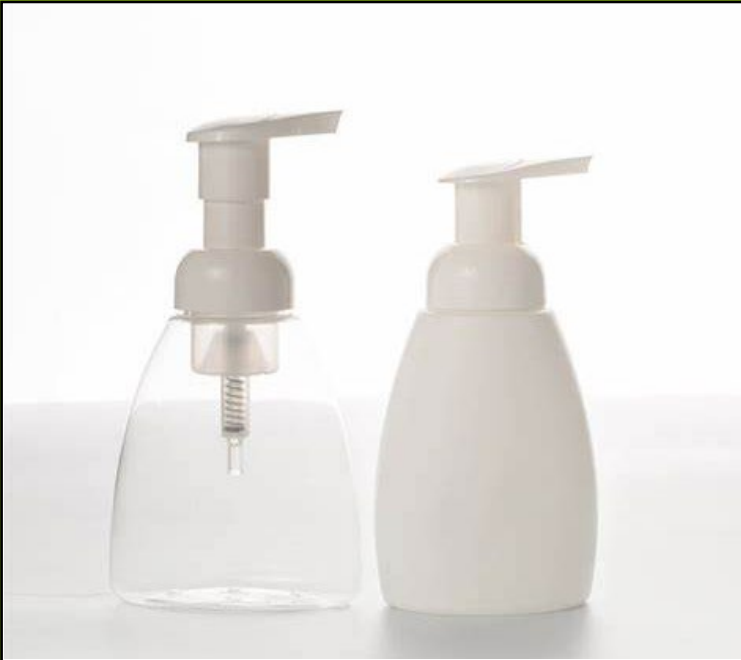
Bottles With Pumps